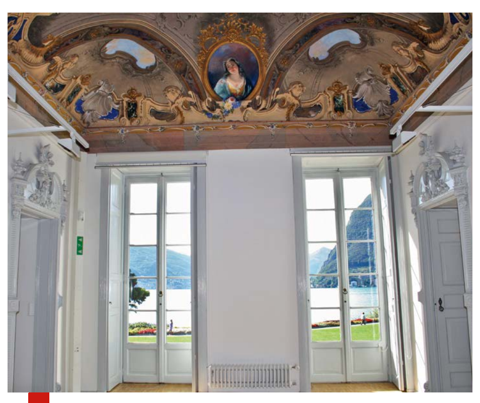
A Hospitality Suite in Villa Ciani

"Take home messages" James O. Armitage, Omaha, NE (USA)